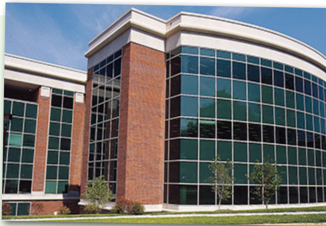
400 Series Curtain Wall.

Standard entrances are designed for commercial and retail applications and come with 2-1/8-inch narrow, 4-inch medium, and 5-inch wide stiles and top rails. Standard doors are constructed using a durable tie-rod assembly that can be modified in the field. Standard doors are compatible with T14000 and 4500 Series storefront framing, and 400 and 200 Series curtain wall framing.